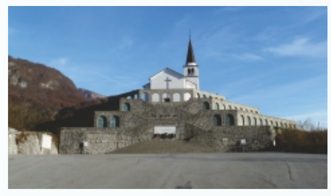
Italian Charnel House, Kobarid, Slovenia

Rozmberk Society p.b.c., tel: +420 724 132 180 Website: http://czechemigrationmuseum.com/networld